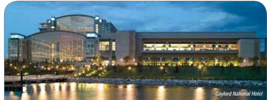
Gaylord National Hotel

42% of participants in the 2011 National Conference on Trusteeship represented independent institutions, and 41% represented public institutions.