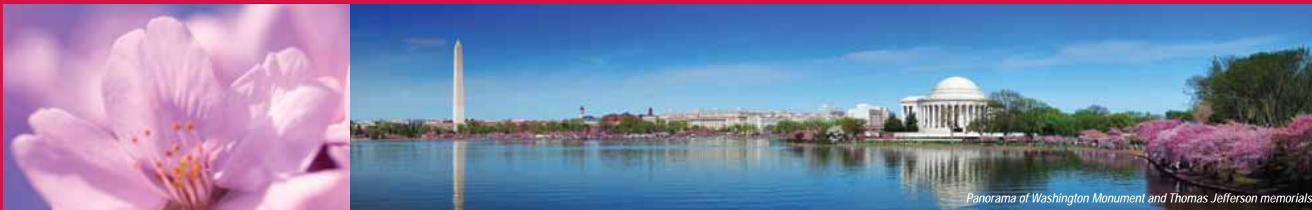
Panorama of Washington Monument and Thomas Jefferson memorials

“To play its indispensable function in the new competitive environment, the typical university must change more quickly and fundamentally than it has been doing.”